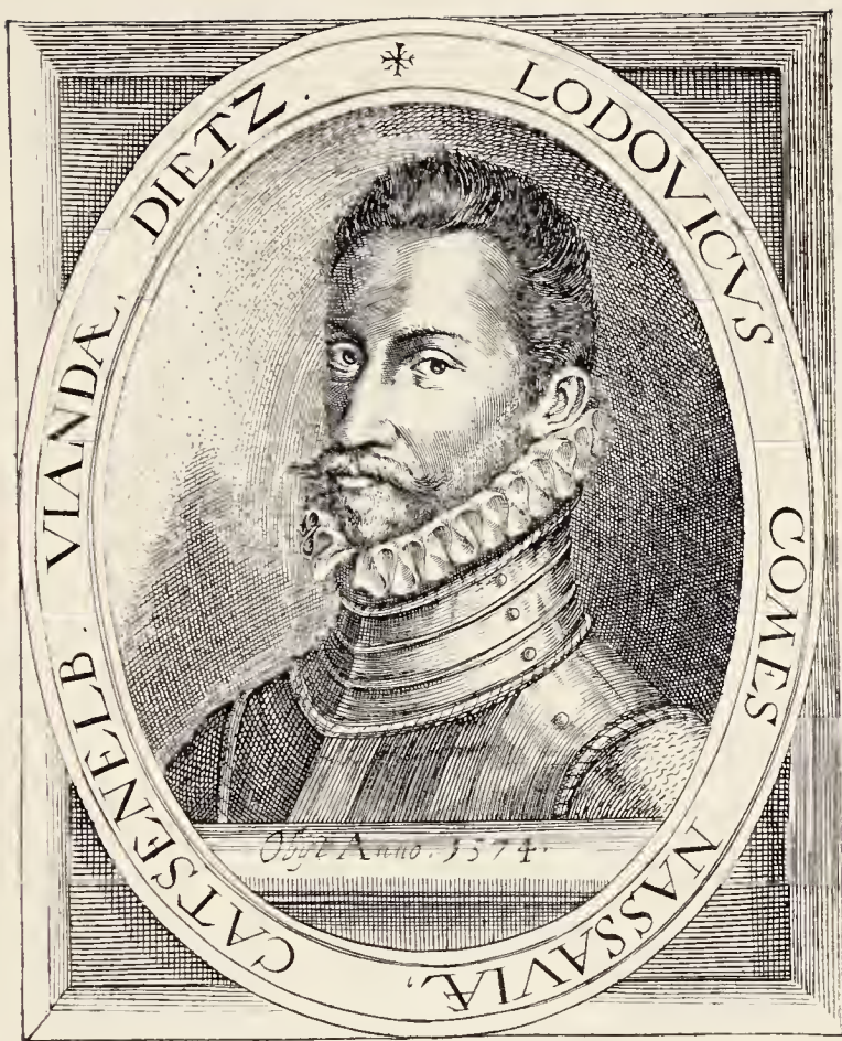
LOUIS OF NASSAU. After a contemporaneous engraving.